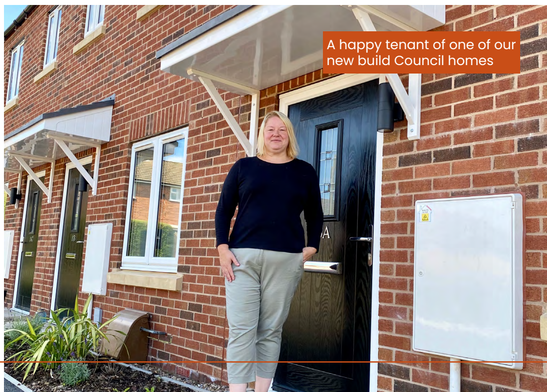
A happy tenant of one of our new build Council homes