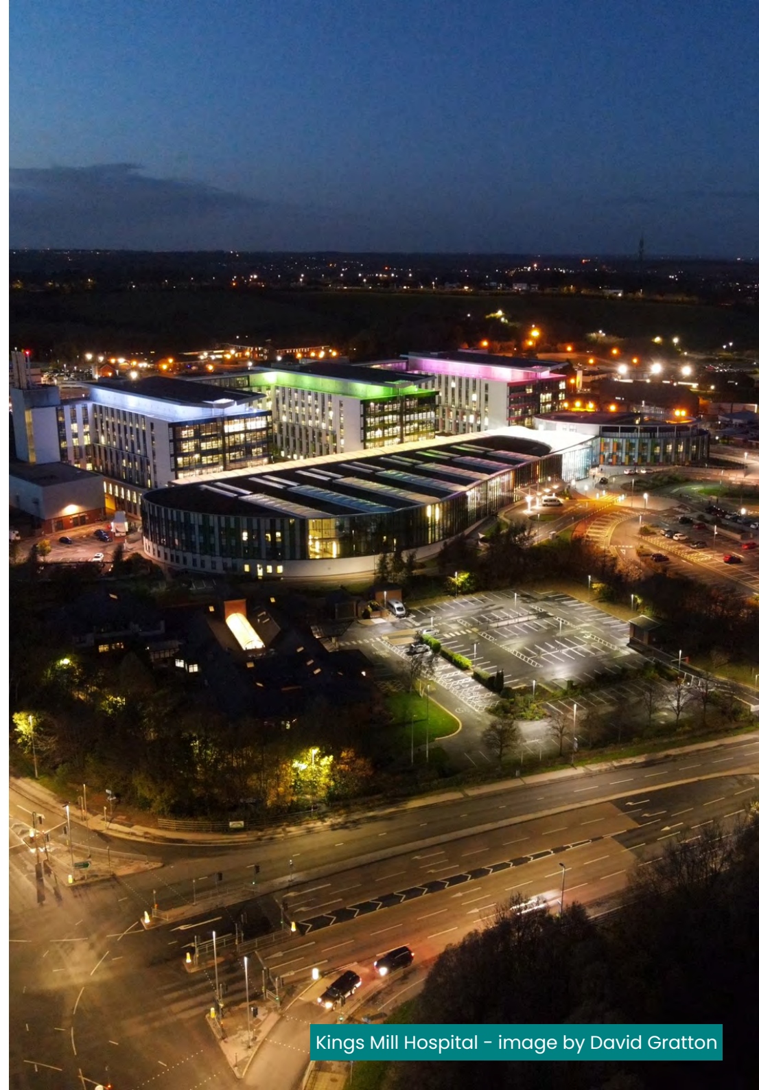
Kings Mill Hospital

The Corporate Plan also aligns with relevant partnership strategies, providing a structured and consolidated approach to successful delivery.