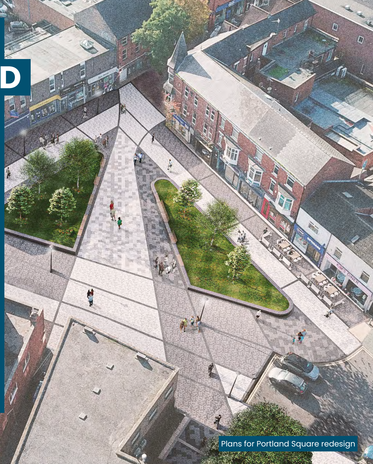
Plans for Portland Square redesign