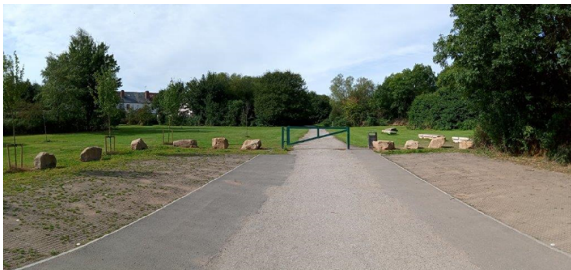
Brierley Forest Park : Car park improvements