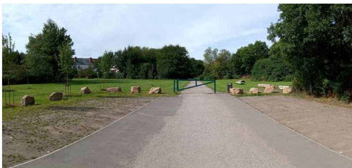
Brierley Forest Park: Car park improvements