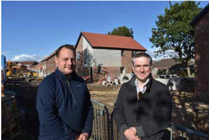
The Council Leader and the Portfolio Holder for Planning and Regeneration at the affordable housing scheme on Frogghopper Lane in Sutton -in-Ashfield