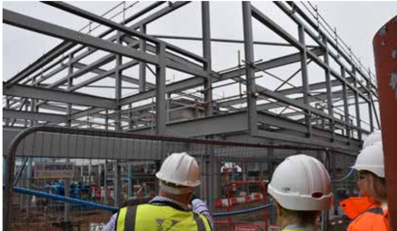
Leisure Centre steelwork