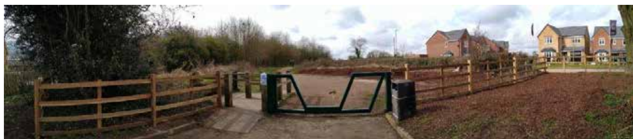
Brierley Forest Park: Brand Lane Entrance Improvements