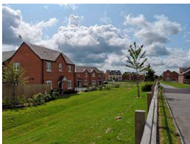
The Larwood residential development in Kirkby-in-Ashfield.

The above table shows that as of 31st March 2021, a net S106 total of £4,432,484.66 was available to fund public open space, education, healthcare, transport, public realm, and affordable housing projects in the district. S106 contributions received from the Larwood residential development at Twickenham Road, Kirkby-in-Ashfield were used to fund affordable homes on the Davies Avenue site (renamed Frogghopper Lane) in Sutton in Ashfield. In partnership with social housing and care organisation EMH group and Homes England, 22 new homes are being constructed including six three-bed houses, ten two-bed houses, four two-bed apartments and two bungalows. One of the bungalows is wheelchair adaptable.