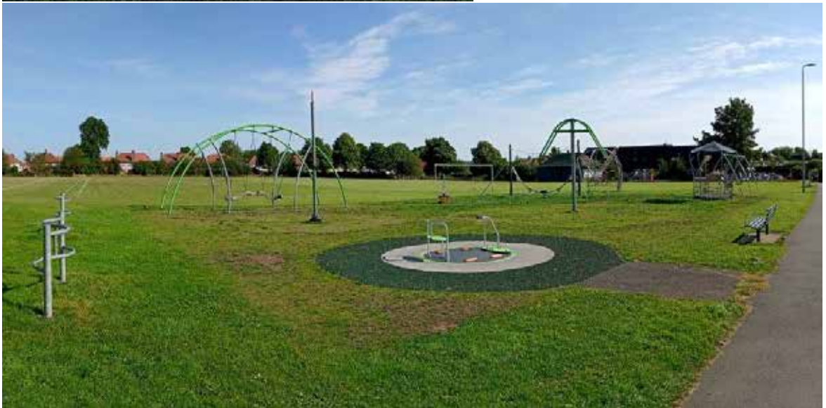
Healdswood Recreation Ground: New play equipment