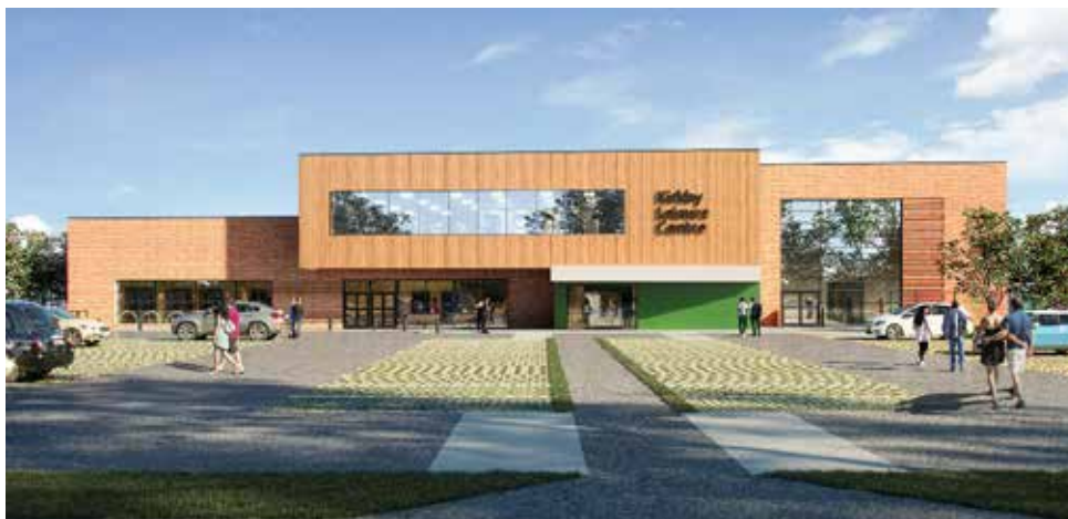
A visualisation of new Leisure Centre. The overall project is due for completion in Autumn 2022.